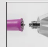
Unique, detachable system