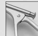
Flushing port for easy cleaning