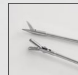
Multiple tips design