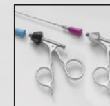
Two handles - multiple options