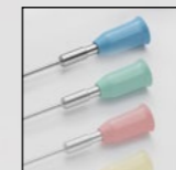
Color coded inserts