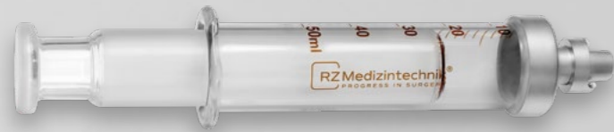
TOOMEY Bladder Syringe, 50cc, complete 253-000-850