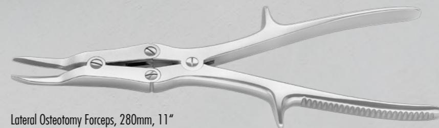
Lateral Osteotomy Forceps, 280mm, 11" 420-370-400