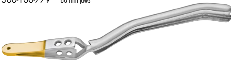
Endoscopic Satinsky Bulldog Clamp, with DeBakey serration golden spring, to be used with 12.5 mm trocar system