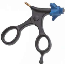
300-450-300 PEEK Polymer Handle, blue rotating wheel, without ratchet