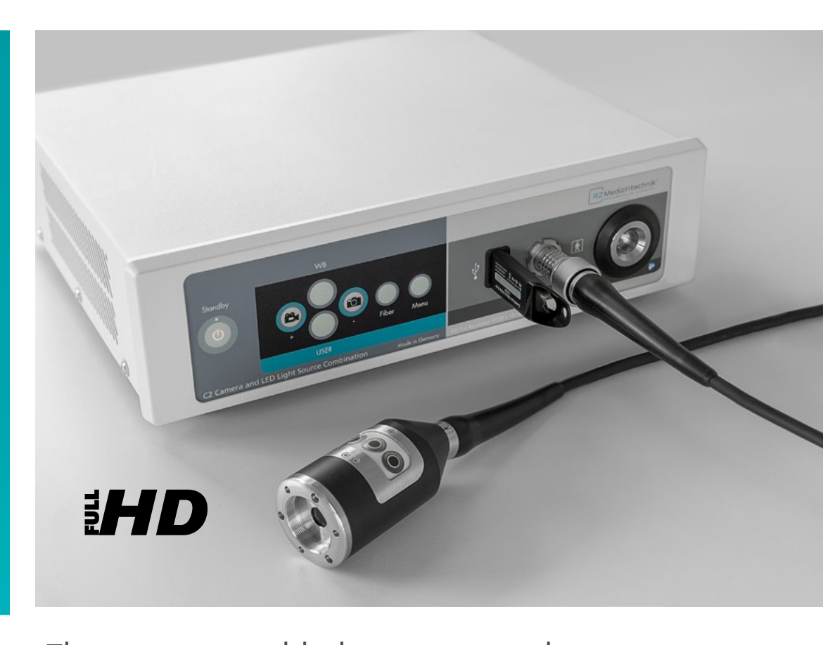
The camera and light source combination