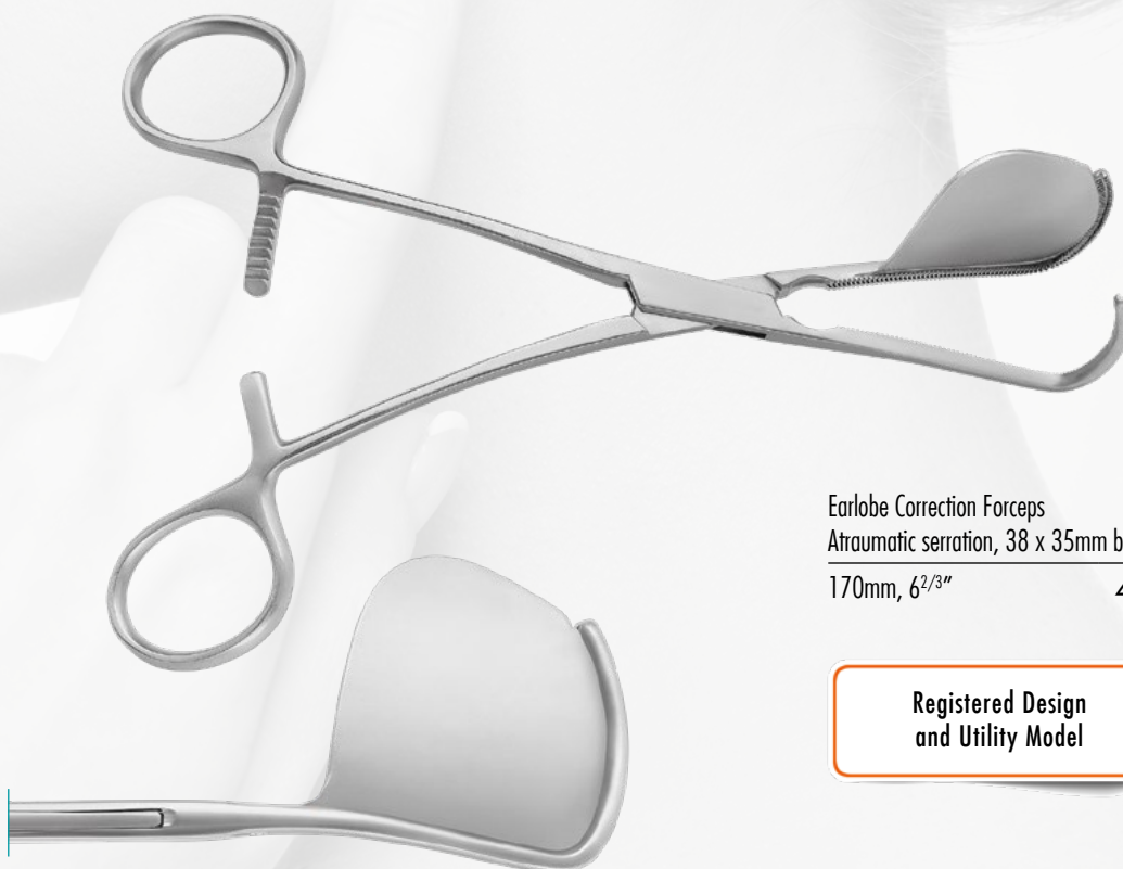
Earlobe Correction Forceps Atraumatic serration, 38 x 35mm blade (L x H) 170mm, 6 2 / 3 " 410-901-000