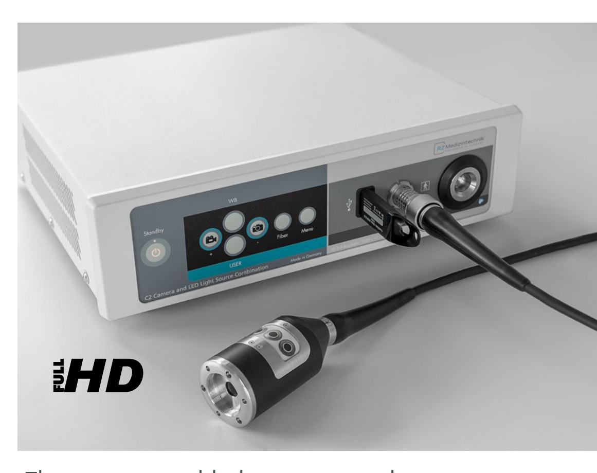
The camera and light source combination